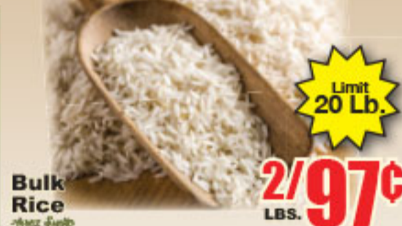
Bulk Rice Arroz Suizo