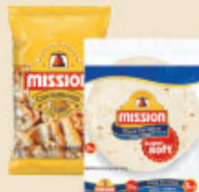
Mission Soft taco or Burrito Tortillas 8-10 count Chicharrones assorted