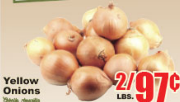
Yellow Onions Chichis Amarillos