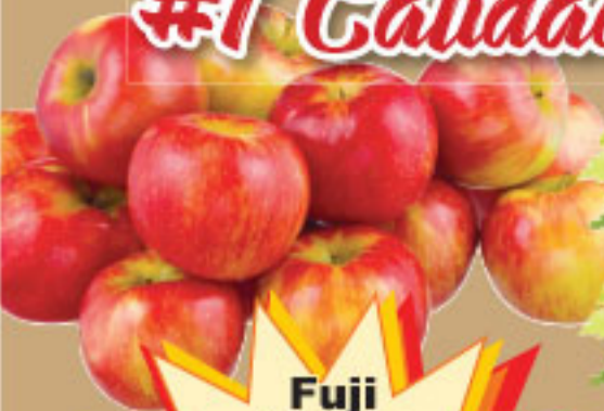
Fuji Apples Manzanas