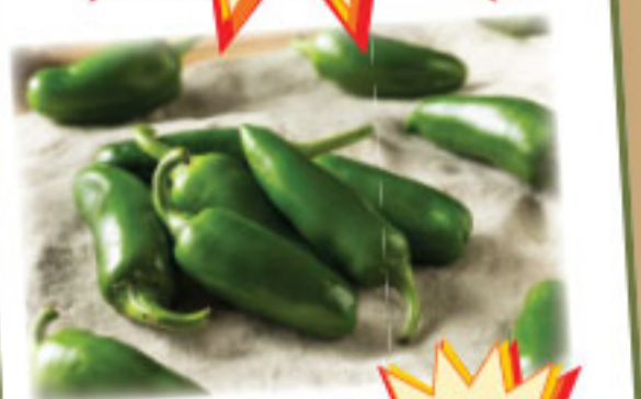
Jalapeño Peppers Chiles Jalapeño