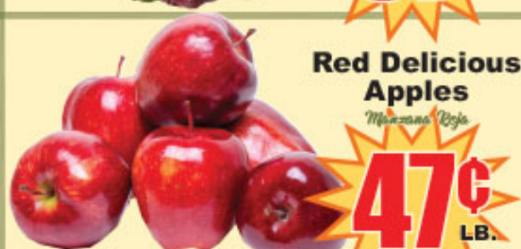
Red Delicious Apples Manzanas Rojas