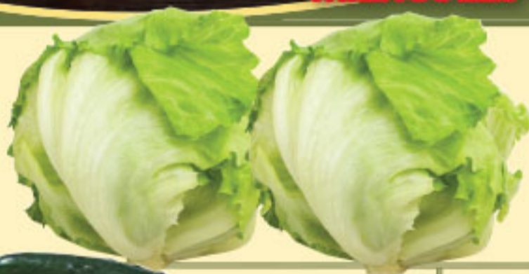
Iceberg Lettuce Lechuga