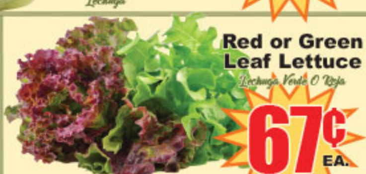
Red or Green Leaf Lettuce Lechuga Verde O Roja