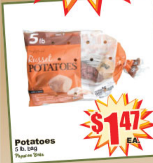
Potatoes 5 lb. bag Papas en Bolsa