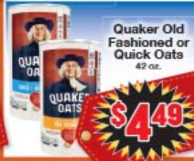
Quaker Old Fashioned or Quick Oats 42 oz.