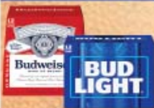
Budweiser or Bud Light Beer 12 pack, 12 oz. cans or bottles