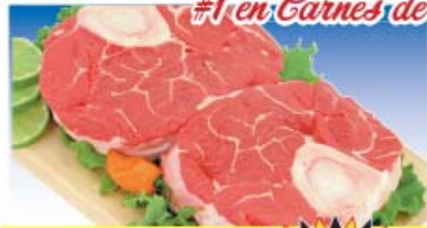
Beef Shanks Value Pack Chamorro de Res