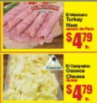
El Mestizo Turkey Ham Jambá de Puerco