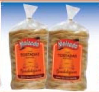
Maizada Corn Tostadas 7.58 oz.