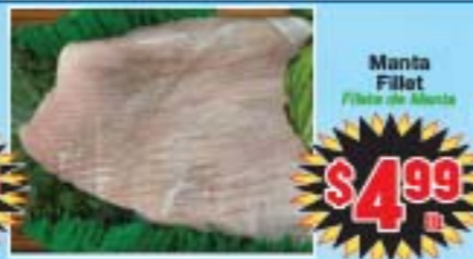
Manta Fillet Filete de Manta