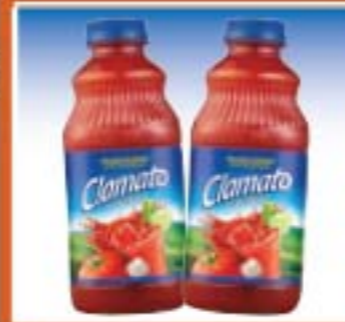
Clamato Regular Cocktail Juice 32 oz.