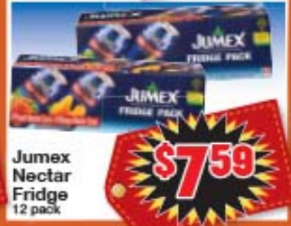
Jumex Nectar Fridge 12 pack