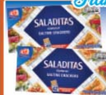
Gameasa Saltines 16.2 oz.