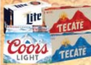
Coors, Miller or Tecate Beer 18 pack, 12 oz. cans or bottles