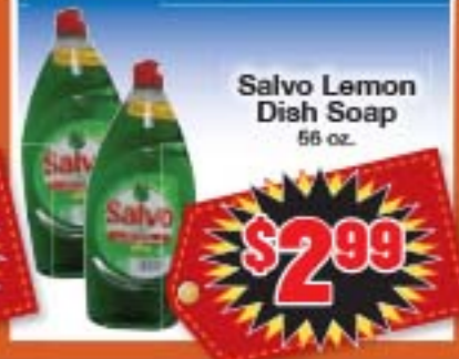
Salvo Lemon Dish Soap 56 oz.