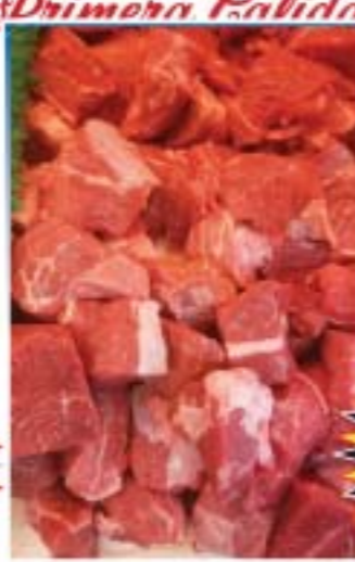
Beef Stew Meat Trocitos Limpios de Res