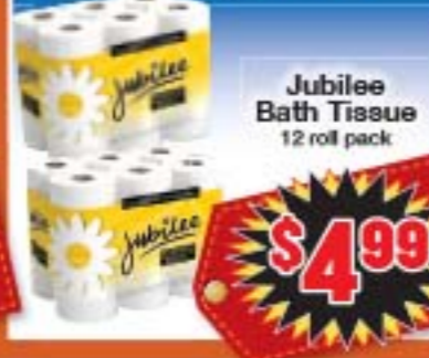
Jubilee Bath Tissue 12 roll pack