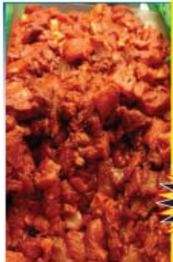
Marinated Diced Pork Value Pack Puerco al Pastor