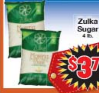
Zulka Sugar 4 lb.