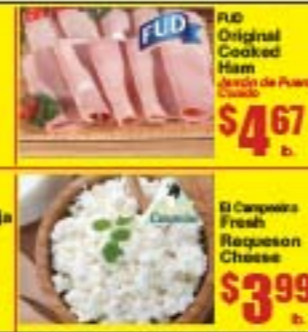
RFD Original Cooked Ham Jambá de Puerco