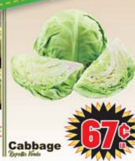
Cabbage Dorada Verde