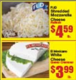
RFD Shredded Mozzarella Cheese 4 lbs.