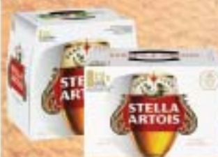
Stella Artois Beer 12 pack, 11.2 oz. cans or bottles