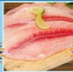
Basa Fillet Filete de Basa