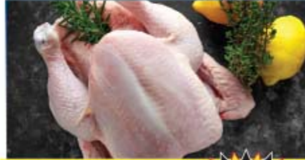
Fresh Whole Chicken Twin Pack Pollo Entero