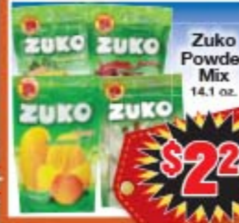
Zuko Powder Mix 14.1 oz.