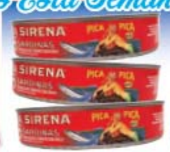
La Sirena Sardines 15 oz.