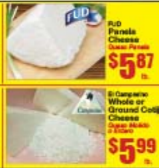
RFD Pirella Cheese Queso Pirella