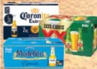
Coronita, Modelito or Dos Equis 24 pack, 7 oz., bottles