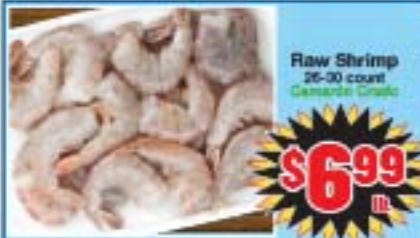
Raw Shrimp 26-30 count Camaron Crudo