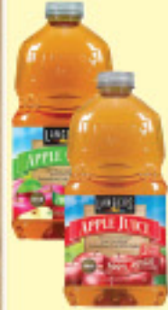
Langers Apple Juice or Cider 64 oz. First 2 All Others 2/$5 Jugo