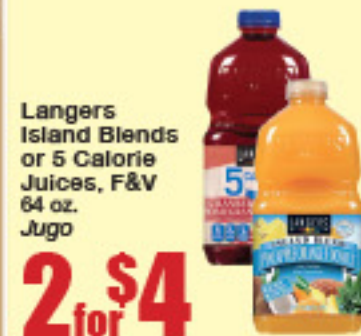
Langers Island Blends or 5 Calorie Juices, F&V Jugo