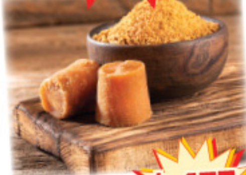
Cone Brown Sugar Piloncillo