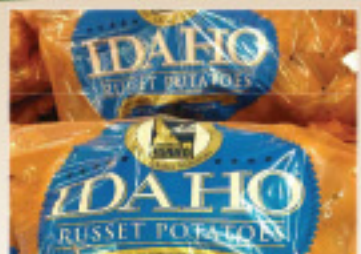
Potatoes 10 lb. Bag Papas en Bolsa