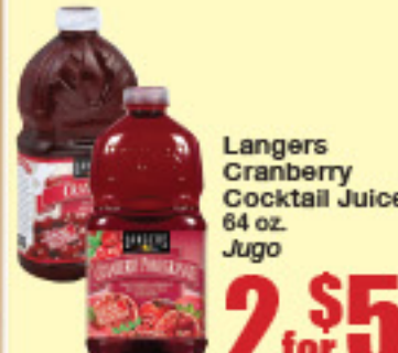
Langers Cranberry Cocktail Juice 64 oz. Jugo