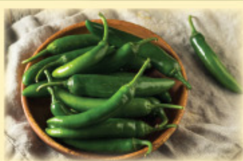
Serrano Peppers Chiles