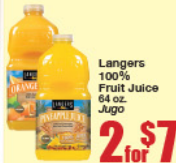
Langers 100% Fruit Juice 64 oz. Jugo