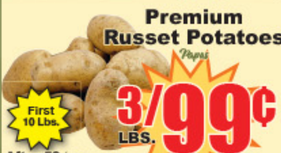
Premium Russet Potatoes Papas