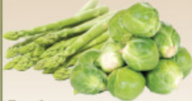
Fresh Asparagus or Brussels Sprouts Espárgagos o Chiles de Bruiser