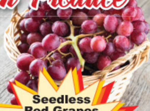
Seedless Red Grapes Una Roja