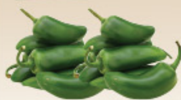
Jalapeno Peppers Chiles Jalapeno