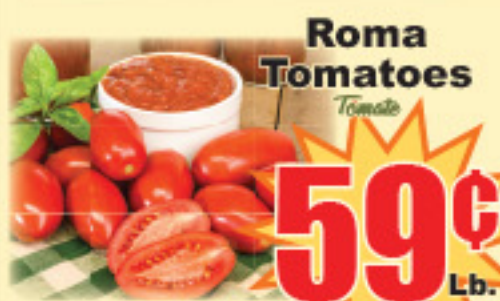
Roma Tomatoes Tomate