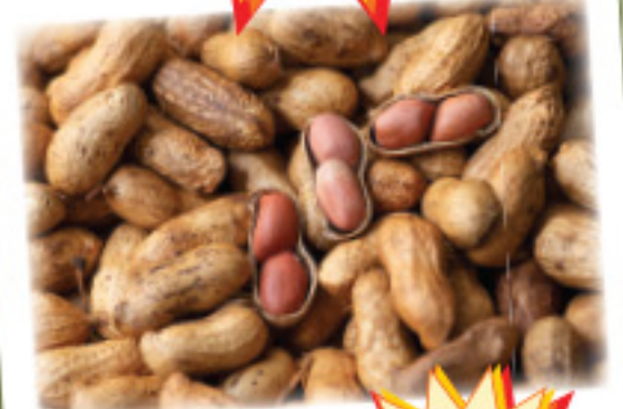
Bulk Toasted Peanuts Cacahuates Tostado