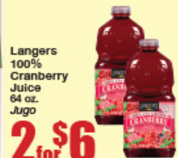
Langers 100% Cranberry Juice 64 oz. Jugo