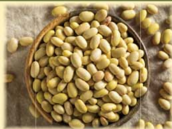
Peruvian Beans Peruano Frijole