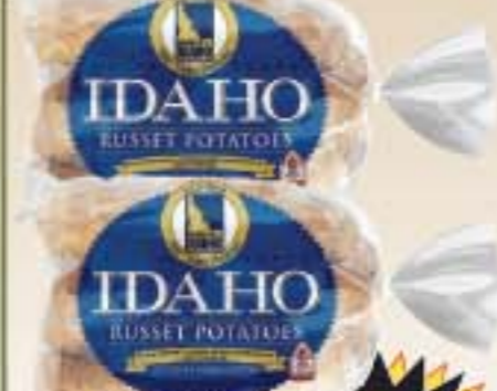
Potatoes 5 lb. bag