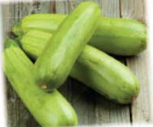
Gray Squash Calabacitas Mexicana