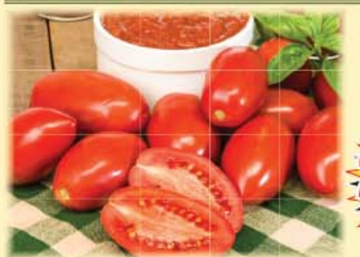
Roma Tomatoes Tomate