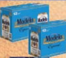
Modelo Especial 12 pack, 12 oz. cans