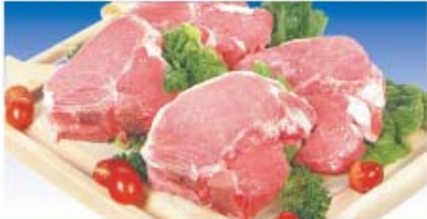
Center Cut Pork Loin Chops Value Pack Chuleta de lomo de puerco