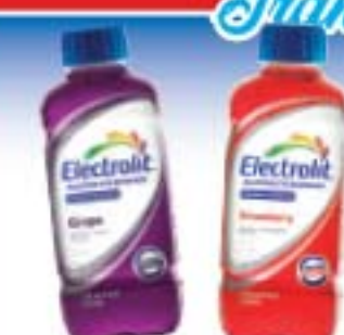
Suero Electrolit assorted flavors 21 oz.