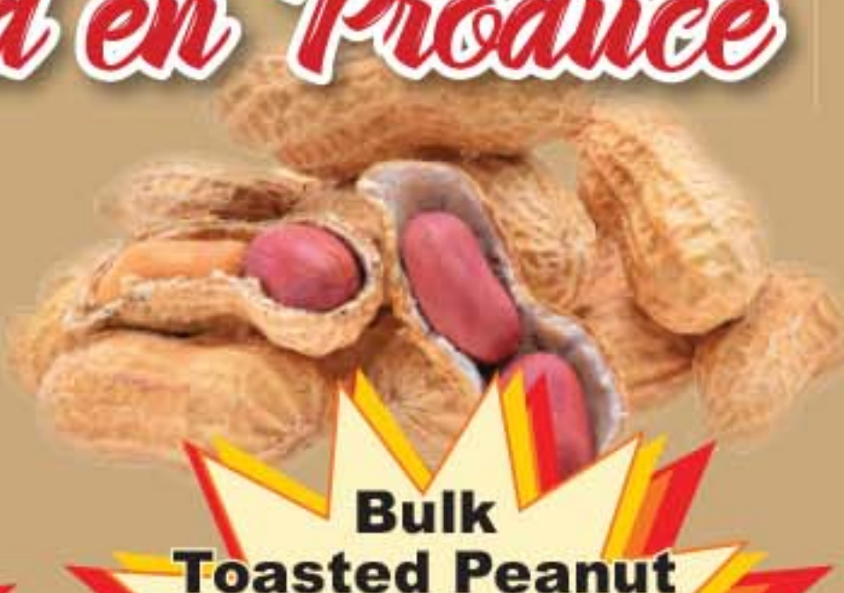
Bulk Toasted Peanut Cacahuates Tostado