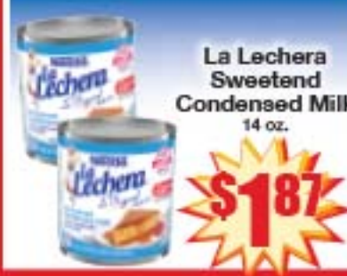
La Lechera Sweetened Condensed Milk 14 oz.