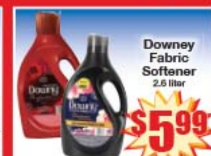
Downey Fabric Softener 2.6 liter