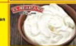
Mexican Creams With or Without Salt Queso de Panela