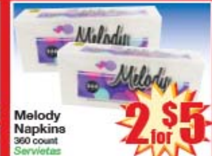
Melody Napkins 360 count Servietas