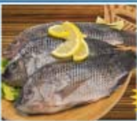
Whole Tilapia 500 grams Mujerita de puerco