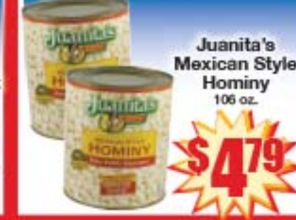
Juanita's Mexican Style Hominy 106 oz.