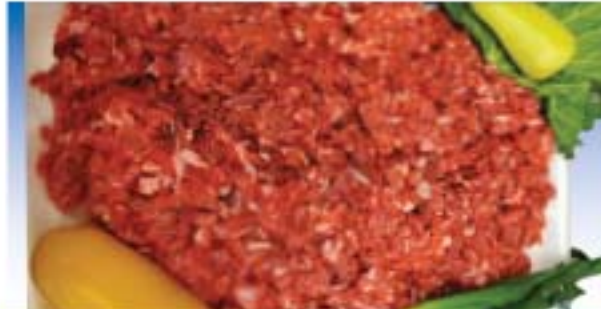
Diced Beef For Tacos Picadita de res para tacos