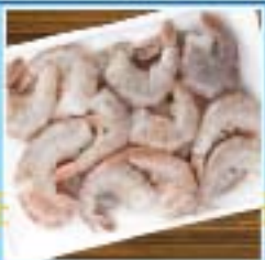
Raw Shrimp 41-50 count Camarón Crudo