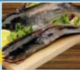
Whole Catfish Sagra Entero