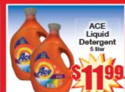
ACE Liquid Detergent 5 liter