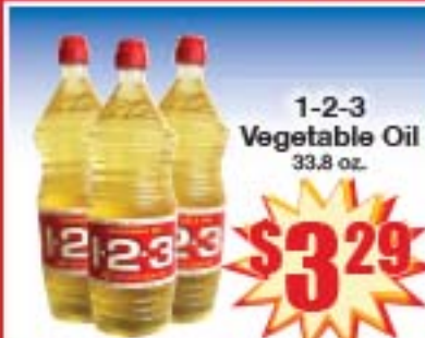
1-2-3 Vegetable Oil 33.8 oz.