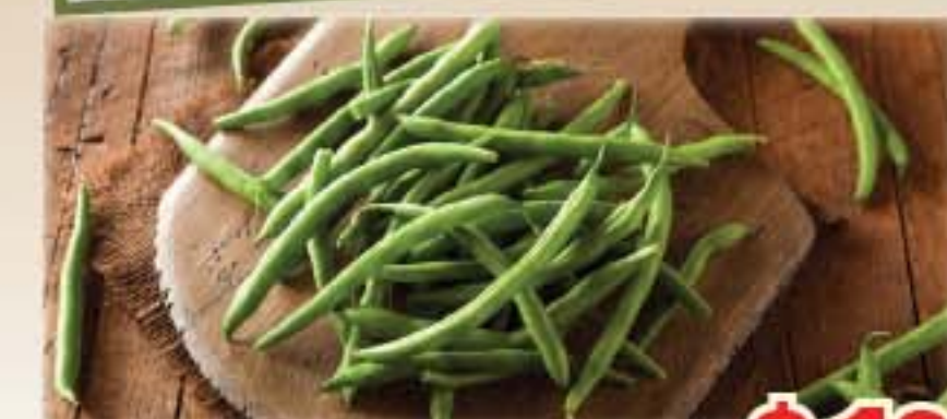
Fresh Green Beans Ejotes