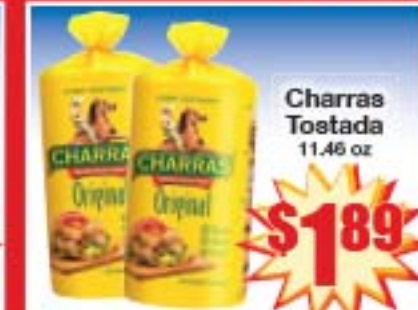
Charras Toastada 11.46 oz.