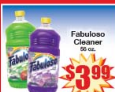
Fabuloso Cleaner 56 oz.