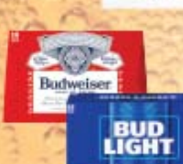
Budweiser or Bud Light Beer 18 pack, 12 oz. cans or bottles