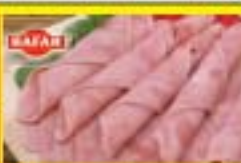
Cooked Turkey Ham Jamon de Puerco