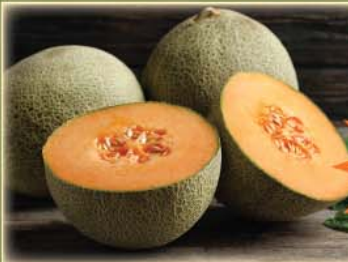
Cantaloupe Melon Chino