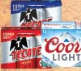
Coors Light or Tecate Beer 12 pack, 12 oz. cans or bottles