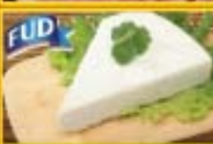
White Mexican Cheese Queso Fresco