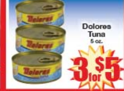
Dolores Tuna 5 oz.