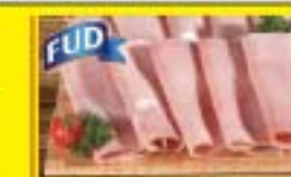
Cooked Ham Jamon Crudo de puerco