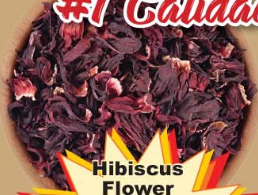
Hibiscus Flower Jamaica