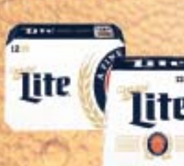
Miller Lite Beer 12 pack, 12 oz. cans or bottles