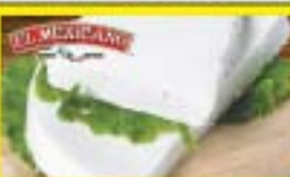
Mascarpone Fresh Cheese Queso Fresco Mascarpone