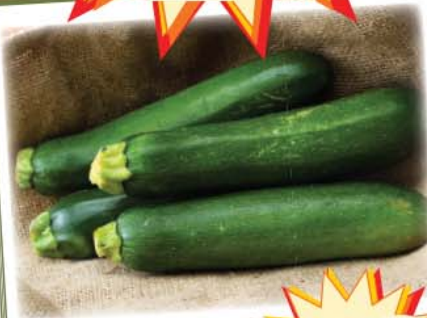
Italian Squash Calabacitas Italiana