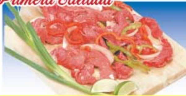
Beef Fajitas with Vegetables Value Pack Fajitas de res con vegetales