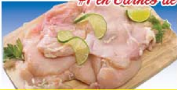
Fresh Chicken Steak Bistek de Pechuga de pollo