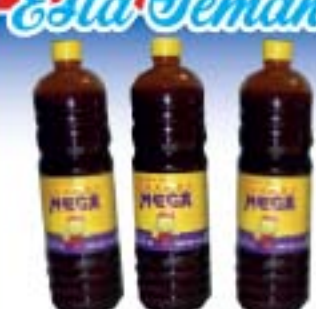
Mega Chamoy 33.8 oz or 1 liter