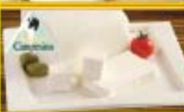
White Cheese Queso Chihuahua