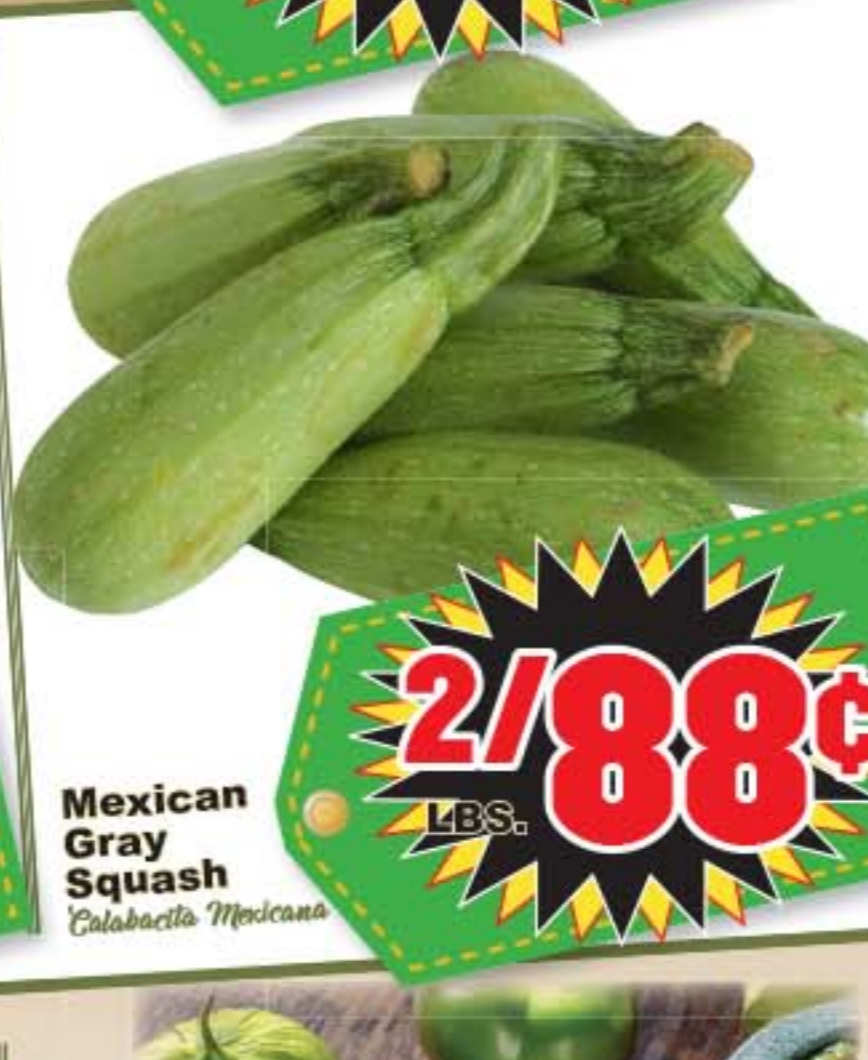
Mexican Gray Squash Calabacita Mexicana