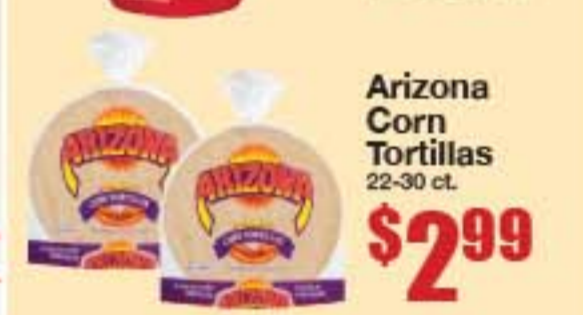
Arizona Corn Tortillas 22-30 ct.