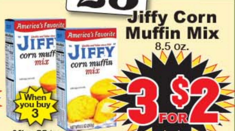
Jiffy Corn Muffin Mix 8.5 oz.