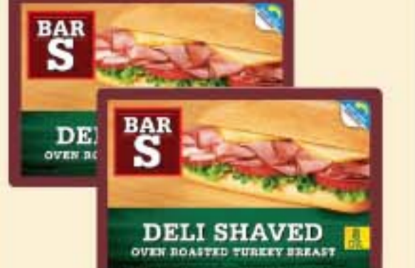
Bar-S Deli Shaved Oven Roasted Turkey Breast 8 oz.