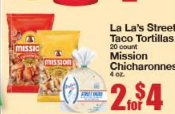
La La's Street Taco Tortillas 20 count