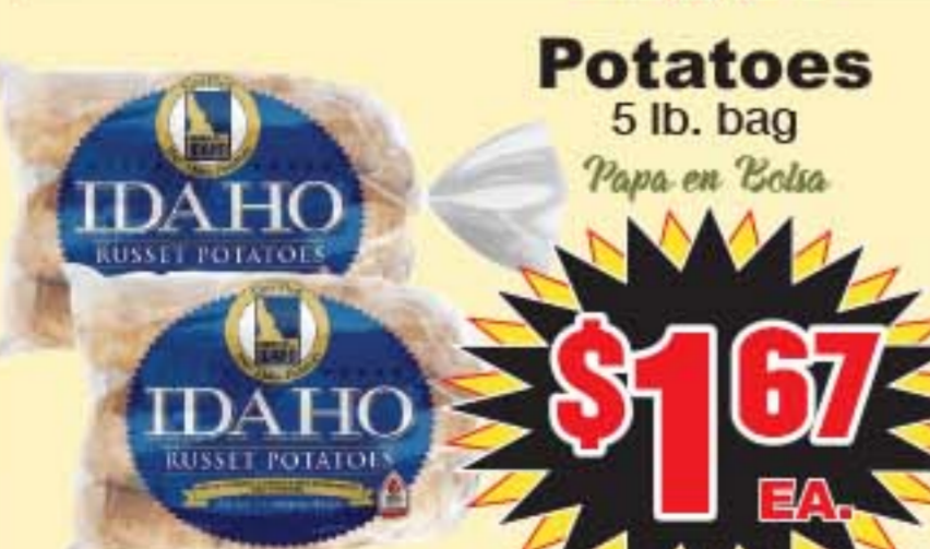
Potatoes 5 lb. bag Papa en Bolsa