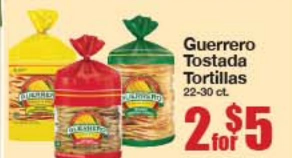
Guerrero Tostada Tortillas 22-30 ct.