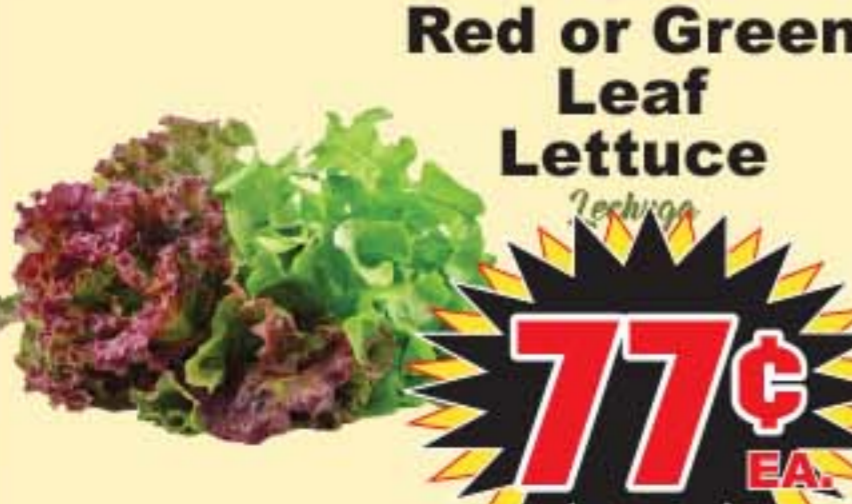
Red or Green Leaf Lettuce Lechuga