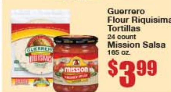
Guerrero Flour Riquisima Tortillas 24 count