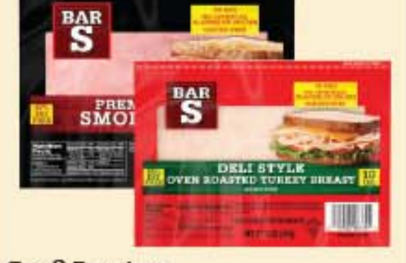
Bar-S Premium Deli Smoked Ham 12 oz. or Deli Style Oven Roasted Turkey 10 oz.