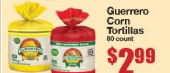
Guerrero Corn Tortillas 80 count