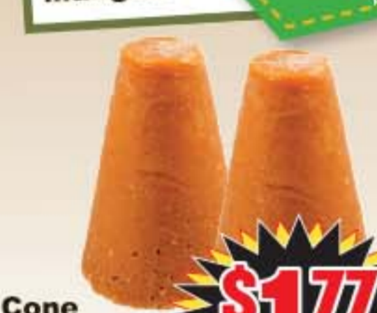
Cone Brown Sugar Princillo