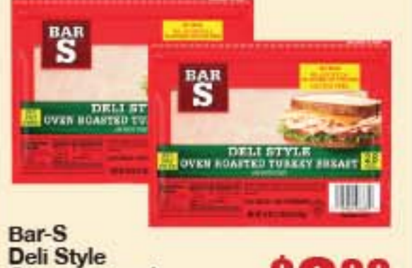
Bar-S Deli Style Oven Roasted Turkey 28 oz.