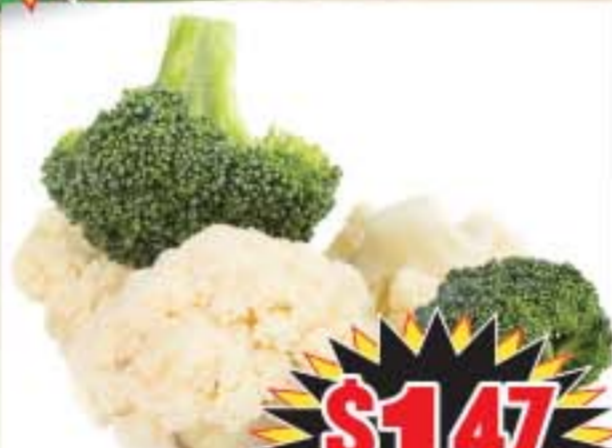
Broccoli or Cauliflower