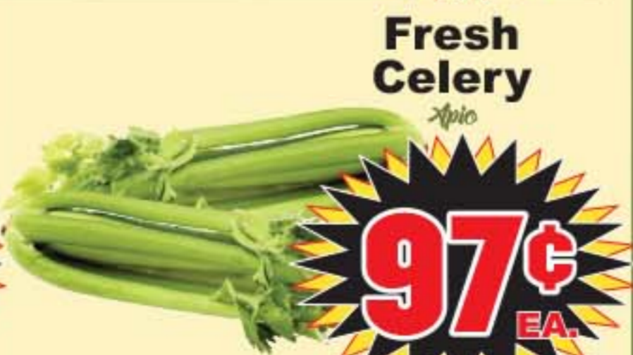
Fresh Celery Apio