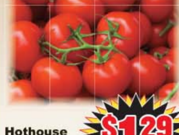
Hothouse Tomatoes on the Vine Tomate Bola