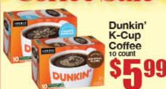
Dunkin' K-Cup Coffee 10 count