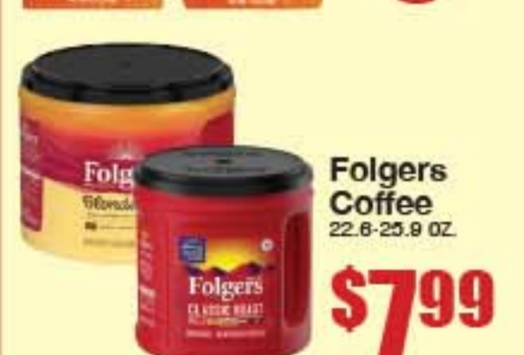
Folgers Coffee 22.6-25.9 OZ.