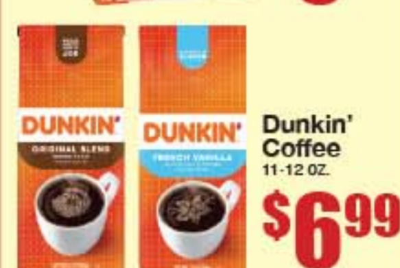
Dunkin' Coffee 11-12 OZ.