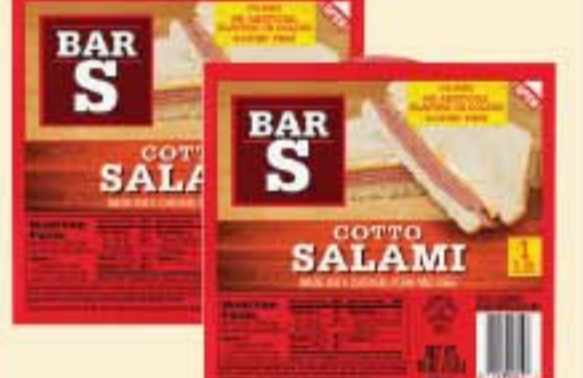
Bar-S Cotto Salami 16 oz.