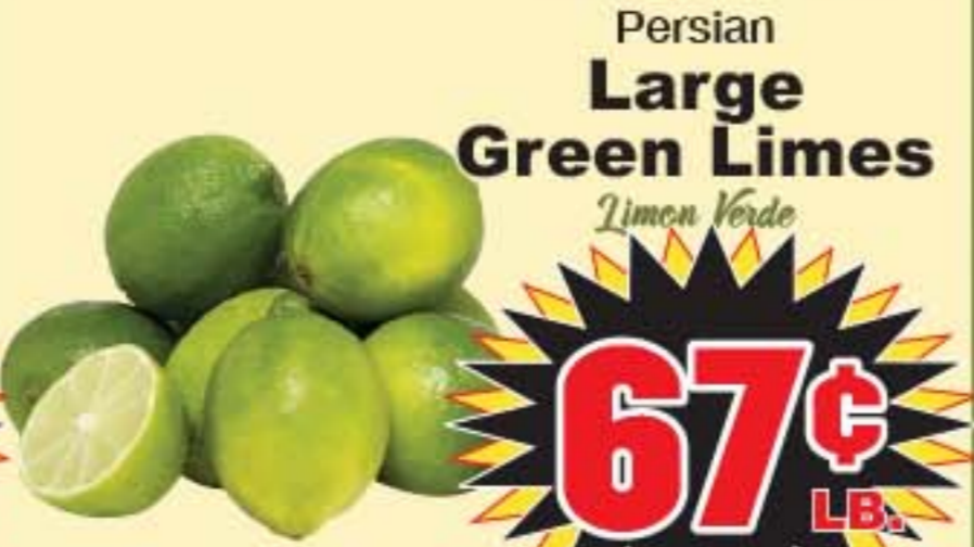
Persian Large Green Limes Limon Verde